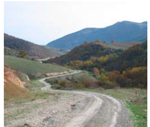
Rural road in Nagorno-Karabagh

The efforts of AUA faculty and experts, along with the compassion and generosity of our donors, are helping to transform the rural countryside of Armenia.