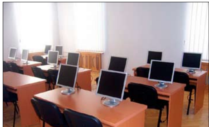
Classroom for adult education in Gyumri

potential bed and breakfast businesses in Stepanakert. These in turn are intended to have larger ripple effects in the development of the surrounding rural communities. AUA uses the expertise and resources of its academic departments to facilitate the