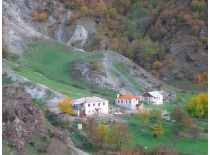
Village of Dadivank in the Republic of Nagorno-Karabagh

rural development in Armenia in March, with the participation of more than 150