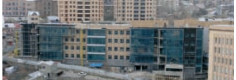
CLASSROOM NAMING CAMPAIGN ACCELERATES AS NEW ACADEMIC FACILITIES NEAR COMPLETION