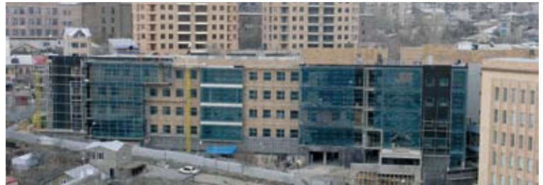
CLASSROOM NAMING CAMPAIGN ACCELERATES AS NEW ACADEMIC FACILITIES NEAR COMPLETION