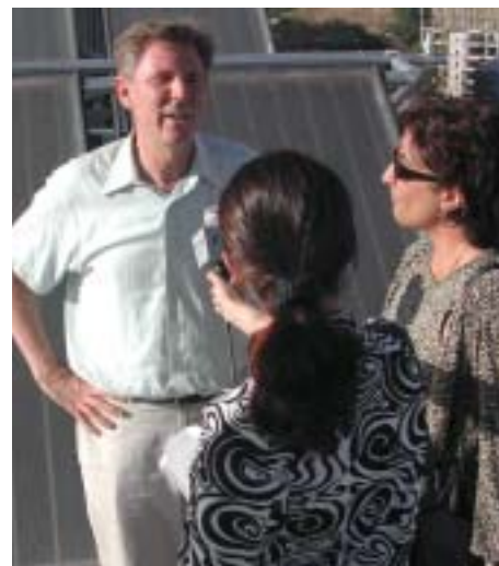
U.S. Congressman Frank Pallone , on the rooftop of AUA, impressed by ERC’s solar energy project